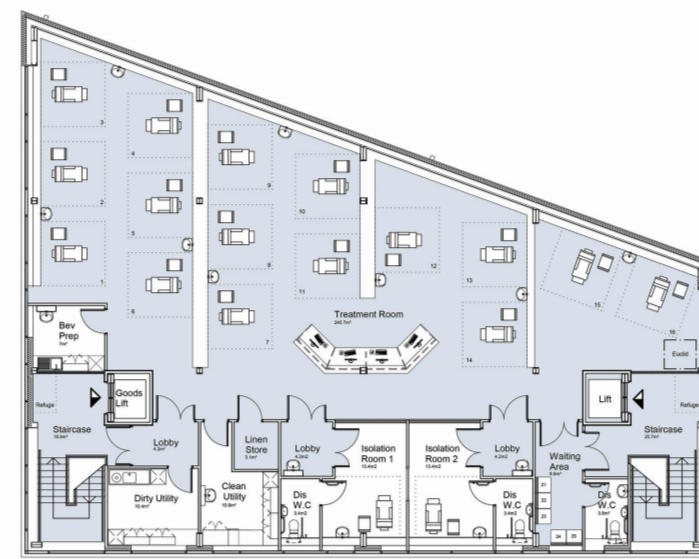
UNITS 9-10 FIRST FLOOR PLAN

The unit has been designed to meet the current standards for satellite dialysis units as outlined within the Department of Health's Health Building Note 07-01 and is also fully compliant with the Disability Discrimination Act (DDA) meaning that ease of access is ensured for every user.